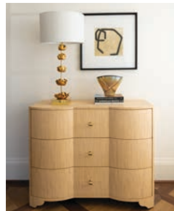
Top Refined without being pretentious, this formal living room exudes casual elegance. Left Organic elements keep this area approachable and beautiful. Center Metallic-printed grasscloth is moody against the playful lights and lacquered vanity. Right This entryway's design and details create a warm welcome for guests.